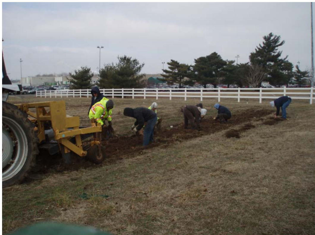
Over an eight-day period in March, Volunteers from Cargill, Beardstown High School and other organizations joined a team from Living Lands & Waters to harvest 100,000 oak tree saplings for transplanting in communities along the Mississippi and Illinois rivers in the region.

Cargill employees from the area's pork processing facility collaborated with Beardstown High School, the Association of Illinois Soil & Water Conservation Districts and Living Lands & Waters volunteers to harvest and distribute 100,000 oak tree saplings to communities along the region's Mississippi and Illinois rivers over an eight-day period earlier this month. Two years ago, the trees were planted adjacent to the Cargill pork facility near Beardstown on company property, then nurtured by volunteers until this year's transplanting effort. Cargill is a longtime supporter of Living Lands and Waters, hosting land and water clean-up activities and sponsoring regional and local conservation and environmental education programs.