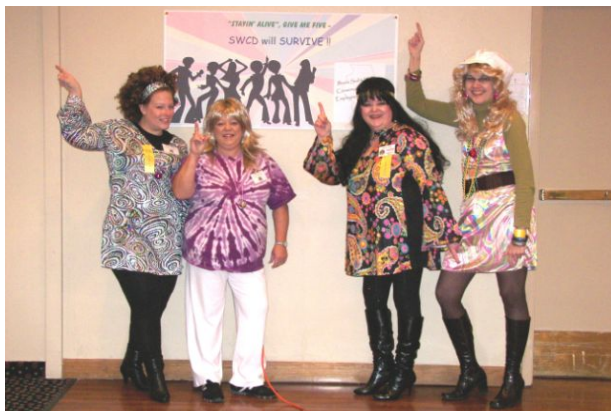
(Left) ISWCDEA's 2009 - 2010 Co-Chairs celebrate another year of "Stayin Alive" at Winter Training.