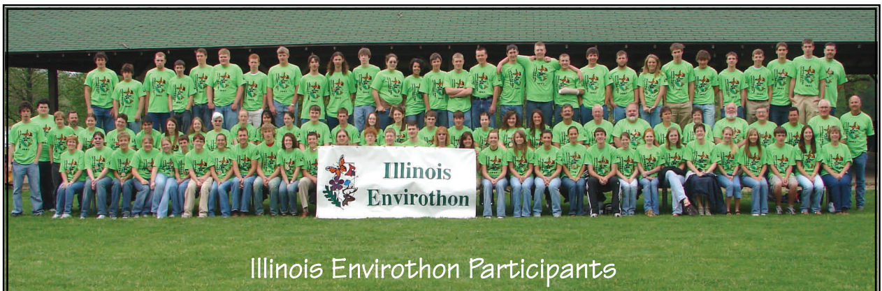
Illinois Envirothon Participants