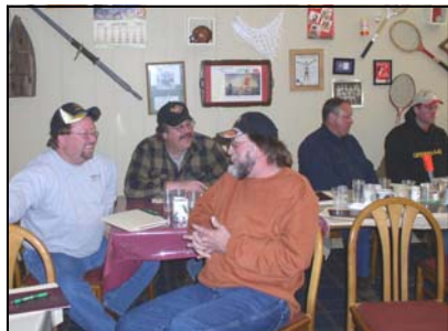
Contractor's Breakfast & Meeting