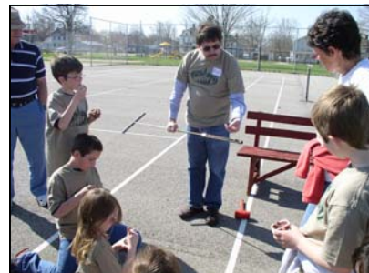
Earth Day Camp