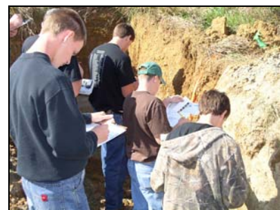
Soils Judging Contest

Through the Partners for Conservation cost-share program, the Henry County Soil and Water Conservation District provides technical and financial assistance on conservation projects. Conservation projects implemented in 2008: