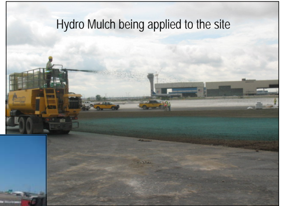
Hydro Mulch being applied to the site