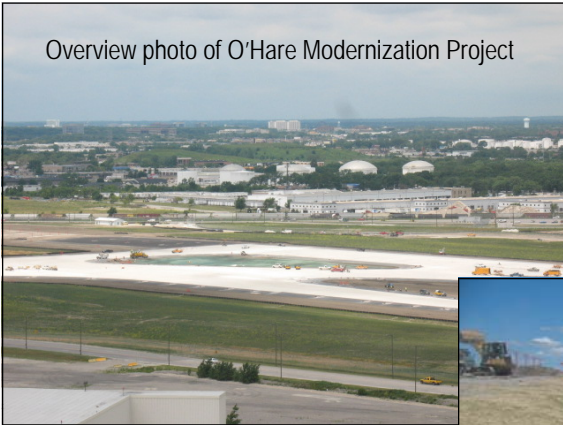
Overview photo of O'Hare Modernization Project